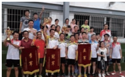
Badminton Competition 羽毛球比賽