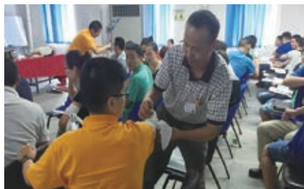
First Aid Training 急救員培訓