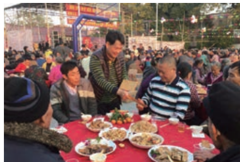
2018 Visit elderly in Tong Xing Village during the New Year, and donation 2018年春節慰問同興村老人及捐贈