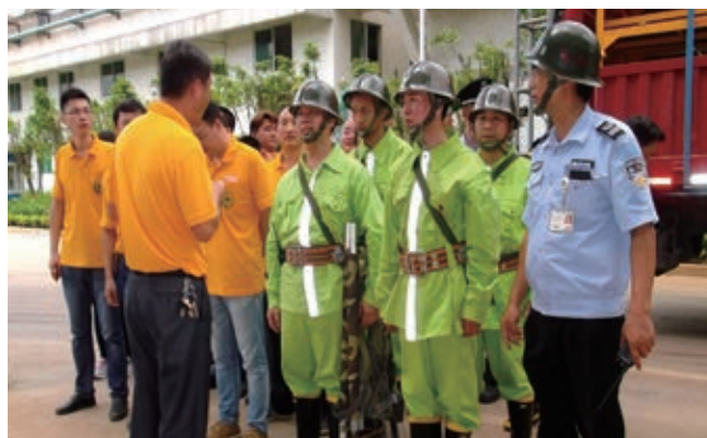
Chemical Spill Drill 化學品洩漏演練