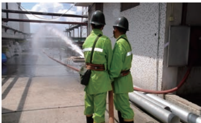
Chemical Spill Drill 化學品洩漏演練