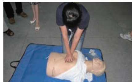
First Aid Training 急救員培訓