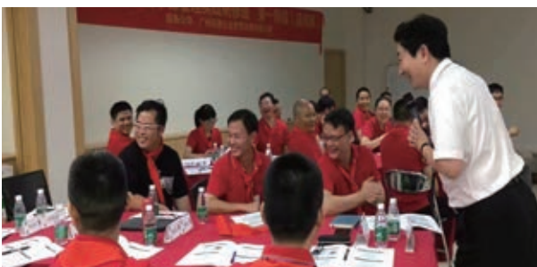
2017 Management Training 2017年中層管理人員培訓