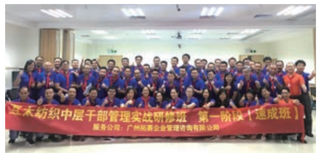
2017 Management Training 2017年中層管理人員培訓