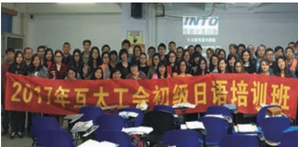
2017 Language courses 2017語言課程

番禺廠制定長期的政策及培訓計劃提高僱員的履職知識和技能。該等政策及計劃覆蓋普通工人的入職培訓以及大學水平、初級及中級水平僱員的內外部職業培訓。番禺廠舉辦各式各樣培訓及發展計劃以提升僱員履行職責及職能時的工作知識和技能，當中涵蓋新僱員入職培訓，讓其在短時間內熟悉公司環境及部門要求；保安員及食堂員工培訓，讓其認識環境安全、財產保護及食物安全控制；急救訓練，倘僱員因工受傷，可妥善有效處理意外，並加強職業健康及安全以防意料之外的職業病；消防培訓，以提高防火意識，一旦遇上小型火災，亦能適當有效滅火；不同部門的在職培訓，以提升僱員在技術及管理上的工作技能及技術。在2017年4月1日至2018年3月31日期間，番禺廠員工每月人均培訓時數約為2.43（上年：2.31小時）。