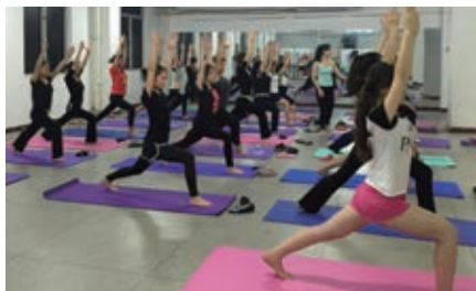
Yoga Class 瑜伽班