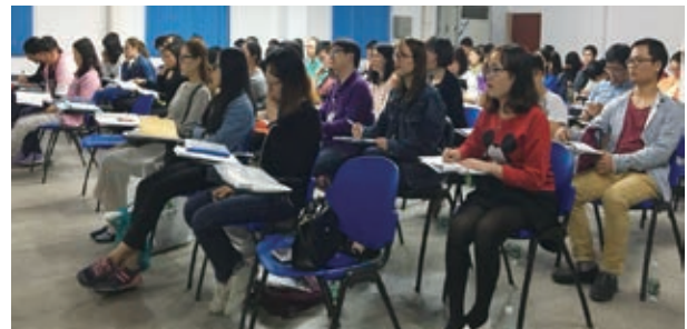
2017 Language courses 2017語言課程