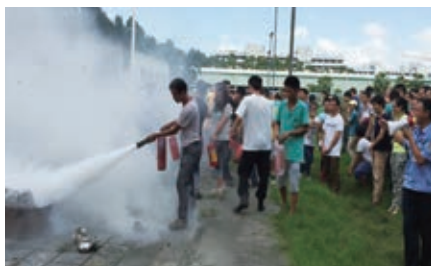
Fire Drill 消防演練

Panyu plant attaches great importance to production safety management and occupational health management. It has spared no effort to implement an occupational health and safety policy of “compliance, care, safety, health, inspection of hidden dangers, risk control, safety assurance, full participation, aggressiveness, promotion of harmonious development”, firmly enforced a policy of “observing laws and regulations, striving to control and reduce safety risks and adhering to the people-oriented principle with an aim to provide a safe and healthy workplace and living environment for employees”, proactively carried out standard procedures for safety production, established a management system of standard procedures for safety production, and obtained OHSAS18001 certification under the Occupational Health and Safety Management System.