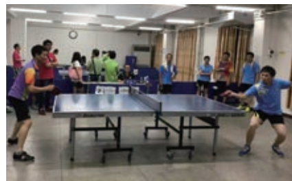
Pingpong Competition 乒乓球比賽